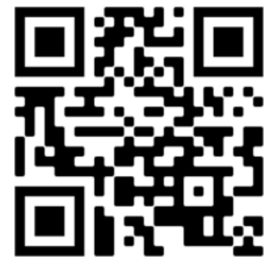
Follow Socials / Contact